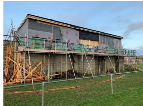
Building Works in progress

RBS was awarded a 5-year lease by the Council in December 2020 and have transformed the outdated pavilion at Rest Bay Playing Fields into a sports / community hub. The work included adding an additional second storey to the building. The building works commenced in February 2020 and are due to be completed in September 2020 when an official opening is planned.