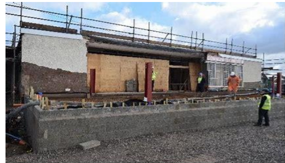
Building Works in progress

The Club was awarded a 35-year lease in October 2018. Bryncethin RFC has transformed the dilapidated pavilion at Bryncethin Playing Fields into a community hub. The work included an extension, an additional second storey and car park. The building element of the project cost £550K. With BCBC providing funding of £110K from the CAT Fund and £56K via S.106 monies. The balance of funding was received from Welsh Government (Community Facilities Programme and Rural Development Fund), the National Lottery (People and Places Fund) and the WRU.